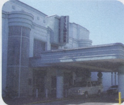
THE FILLMORE THEATRE