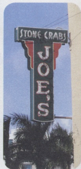
JOE'S STONE CRABS