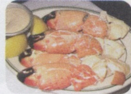
CRABS AT JOE'S